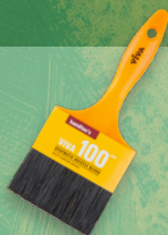
Hamilton's Viva 100mm brush