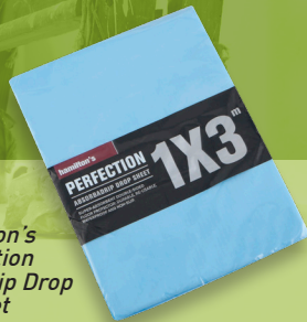
Hamilton's Perfection Absorbent Drop Sheet