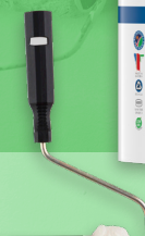
Hamilton's Sheepskin Roller