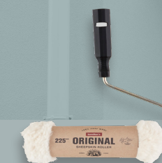
Hamilton's Sheepskin Roller

Finish with 2 coats of any NEO PVA Finishing paints of your choice. Choose from NEO Dur , NEO Multi Dur or Aurora .