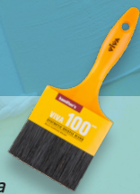
Hamilton's Viva 100mm brush