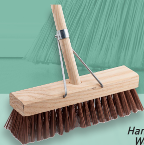
Hamilton's Deluxe Wooden Broom