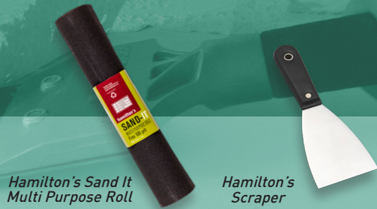
Hamilton's Sand It Multi Purpose Roll