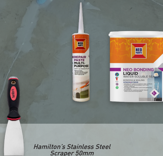
Hamilton's Stainless Steel Scraper 50mm